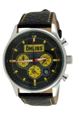
ÖHLINS WATCH Part No: 00097-01 Size: ONE SIZE