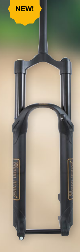
RXF 36 COIL FRONT FORK