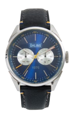
ÖHLINS WATCH 40 YEARS Part No: 00098-01 Size: ONE SIZE