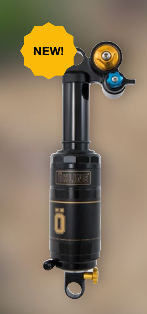
STX 22 AIR CUSTOM SERIES SHOCK ABSORBER

Tailor made for you! We have the perfect part for your bike, delivering outstanding performance at a competitive price. Öhlins manufactures more than 300 different shock absorber models, every one uniquely fitted to your bike and suited to fit without interfering. We make sure that the product behaves the way it should, through the design of the shim stacks and valves as well as the calibration of the adjusters. This is no guesswork. We try the settings out, in real life, and adjust them until everything works perfect for each and every specific model. Then we assemble the products with utmost precision to ensure superior control of the damping force. That is the key to our success.