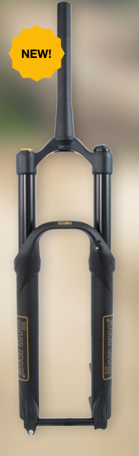
RXF 36 27.5" FRONT FORK