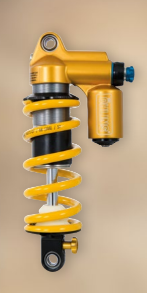
TTX 22 M CUSTOM SERIES SHOCK ABSORBER